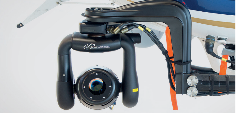
Airbus H135, Wescam MX-15 on camera bracket; Airbus H 135, Trakka A800 on Searchlight Bracket