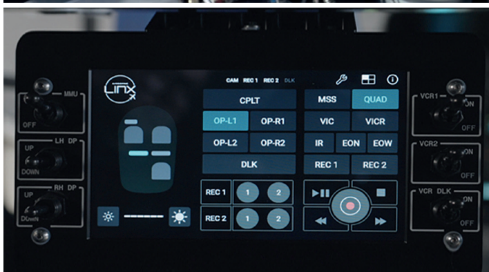
Operator Workstation; Mission Management Unit