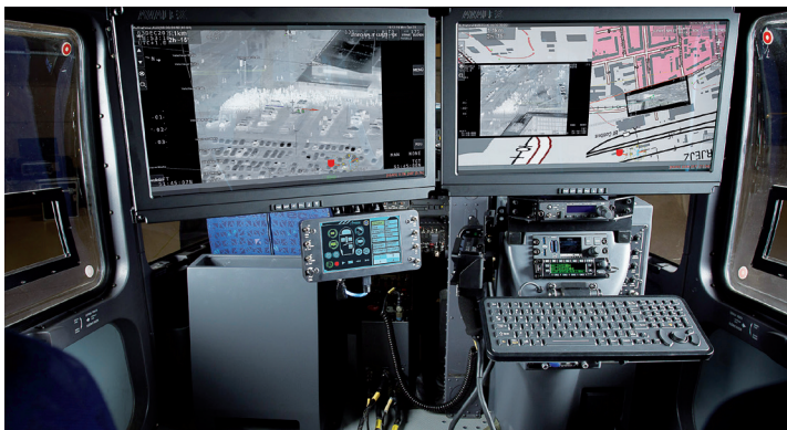
H135 Slovenian Police, Operator Workstation