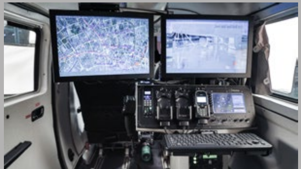
State of the art operator work station