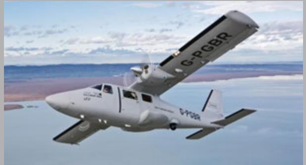
Optimal gimbal position for unobstructed view