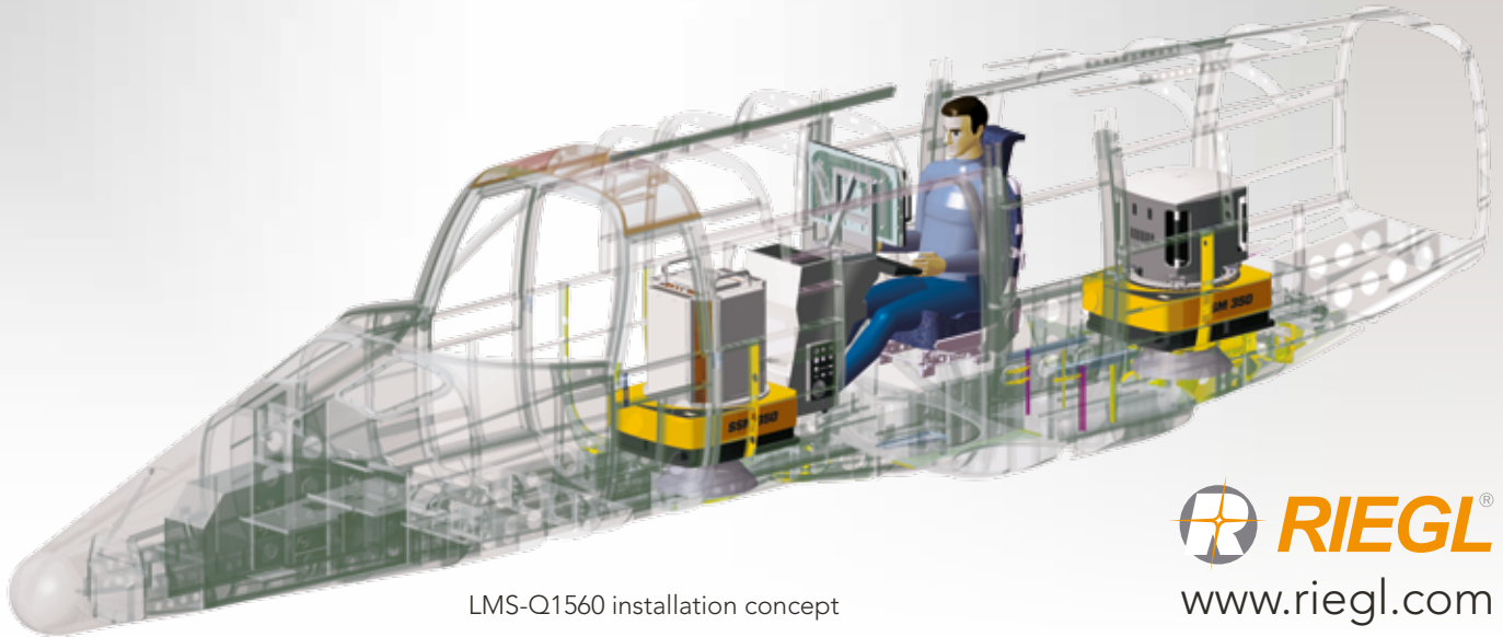
LMS-Q1560 installation concept