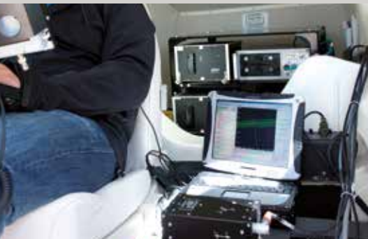
Installation in Tecnam MMA