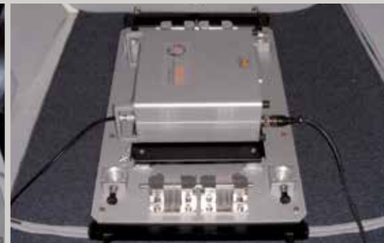
Installation in Vulcanair P68