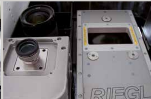
Installation in Cessna 182