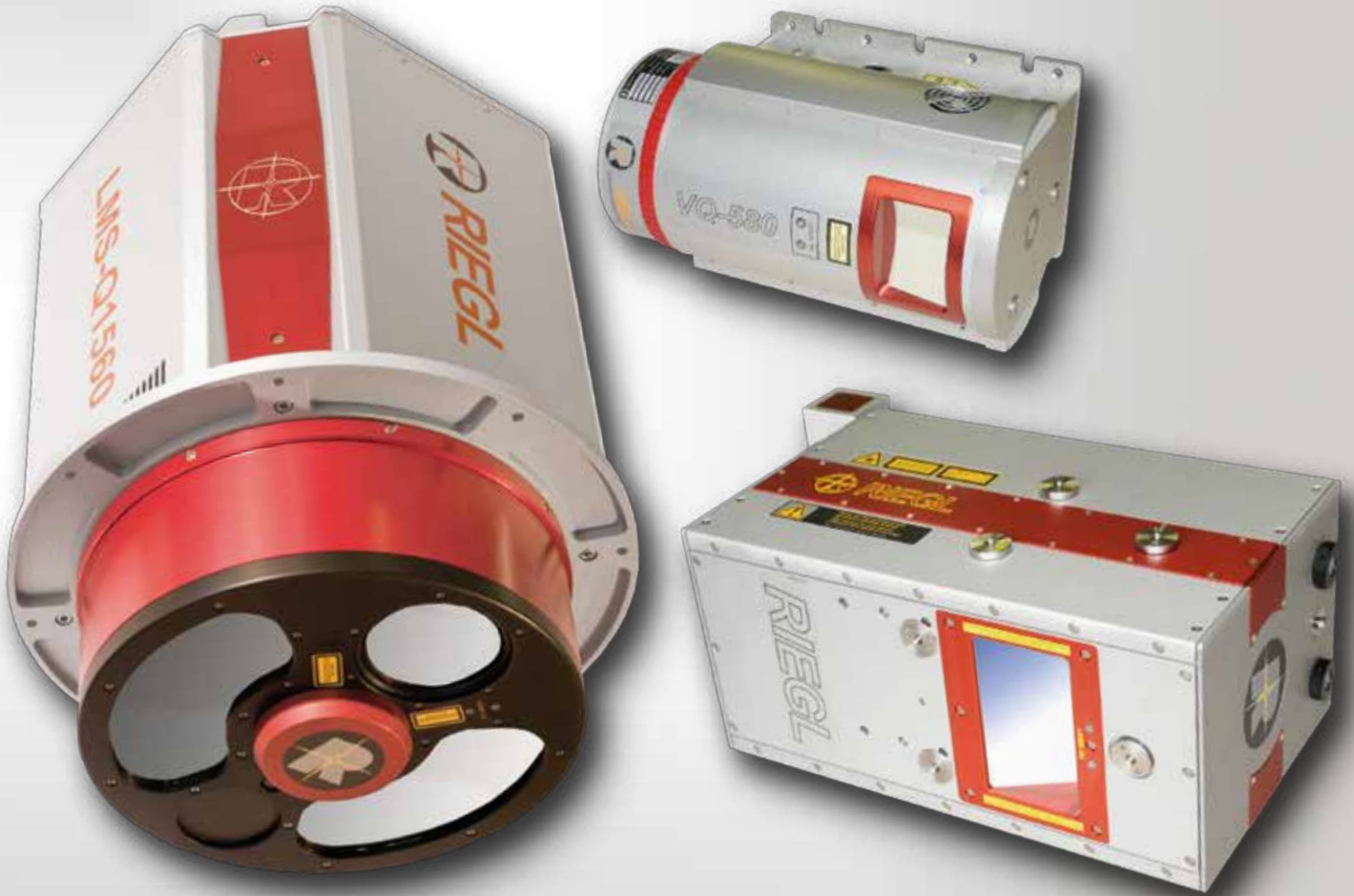
RIEGL LMS-Q1560, RIEGL LMS-Q780, RIEGL VQ-480/VQ-580