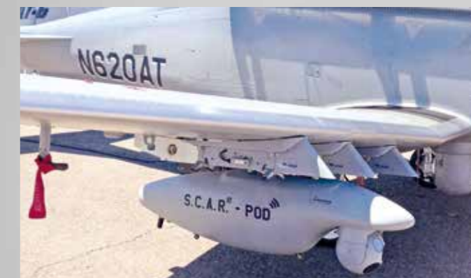
S.C.A.R. – POD on Beechcraft AT-6