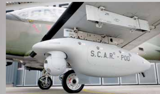
S.C.A.R. – POD on PC-9