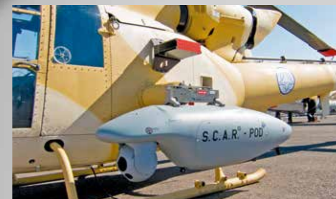
S.C.A.R. – POD on Aerospatiale GAZELLE AS-342