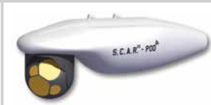
S.C.A.R. 20 – POD